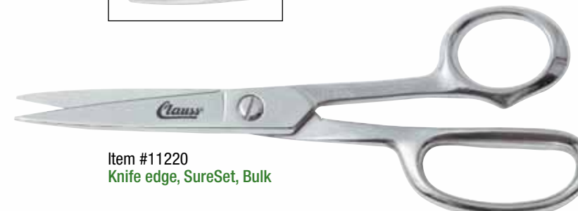
Item #11220 Knife edge, SureSet, Bulk