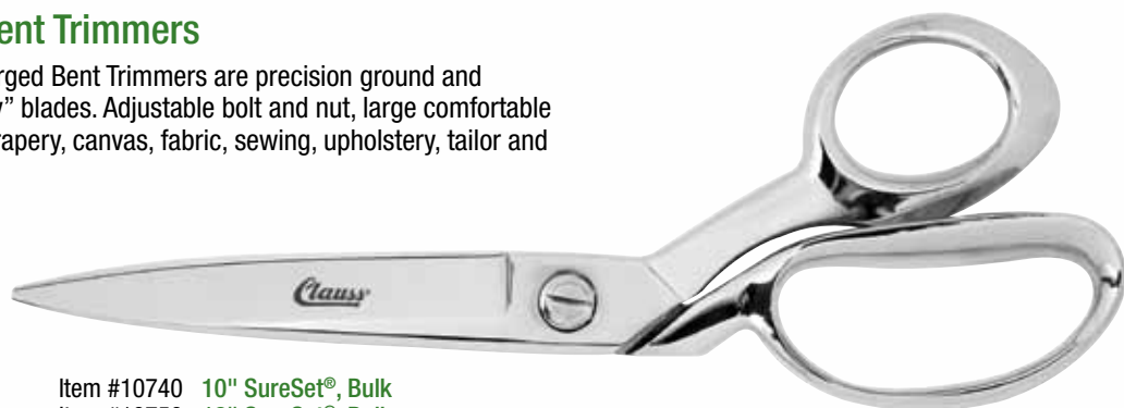
Item #10740 10" SureSet®, Bulk Item #10750 12" SureSet®, Bulk