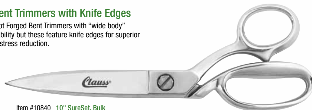
Item #10840 10" SureSet, Bulk Item #10850 12" Bulk