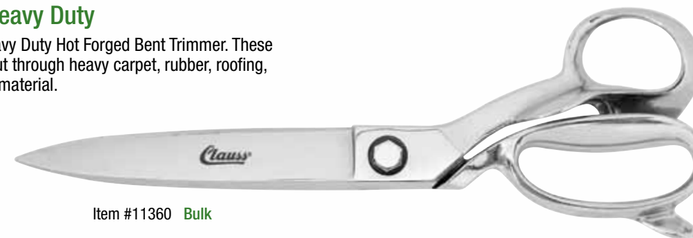
Item #11360 Bulk

This is an Extra Heavy Duty Hot Forged Bent Trimmer. These blades will easily cut through heavy carpet, rubber, roofing, canvas and pins in material.