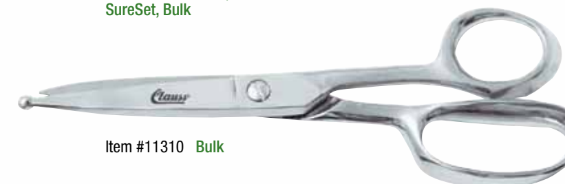
Item #11310 Bulk