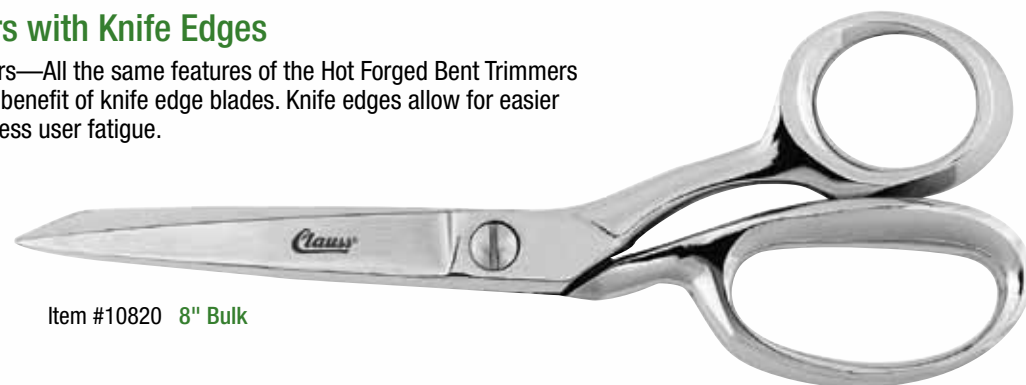
Item #10820 8" Bulk

Knife-Edge Trimmers—All the same features of the Hot Forged Bent Trimmers but with the added benefit of knife edge blades. Knife edges allow for easier cutting action and less user fatigue.