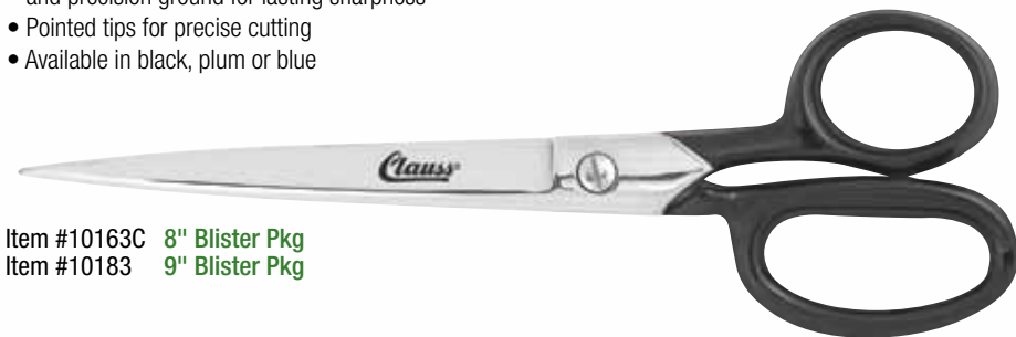
Item #10163C 8" Blister Pkg Item #10183 9" Blister Pkg