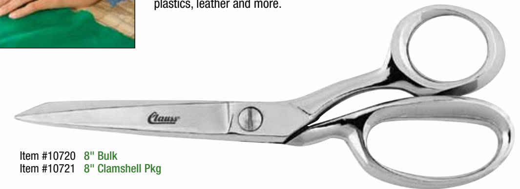
Item #10720 8" Bulk Item #10721 8" Clamshell Pkg

Hot Forged Bent Trimmers are excellent, multi-purpose tools with great strength and durability. Offset handles allow blades to "hug" the work surface. Made of carbon steel, thru-hardened and fully double-plated with chrome over nickel. These trimmers are perfect for drapery, canvas, fabric, upholstery, rubber, vinyl, plastics, leather and more.