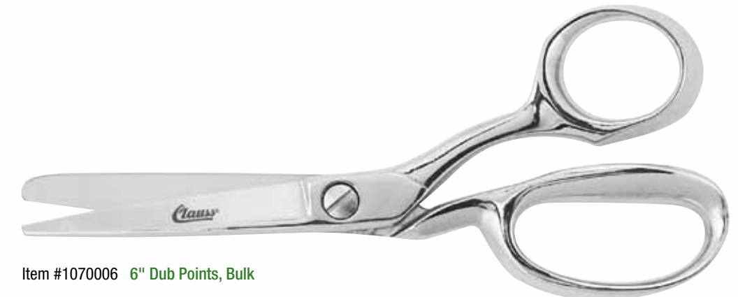
Item #1070006 6" Dub Points, Bulk