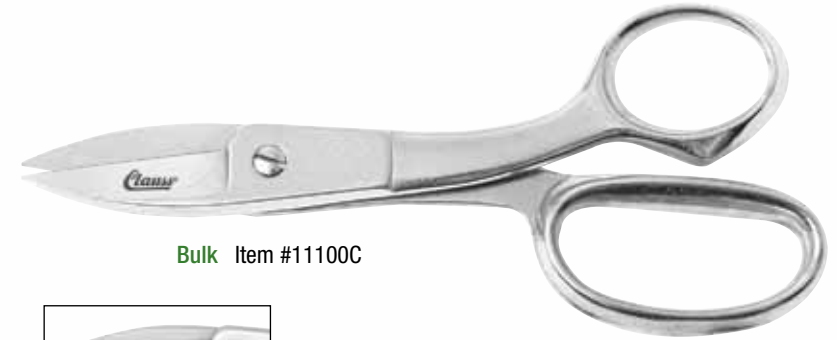
Bulk Item #11100C

Multi-purpose high leverage shears. Hot forged, thru-hardened and fully double-plated chrome over nickel. So versatile they can be used for automotive, rubber, electrical, sewing, textile, leather, construction, MRO and many other applications. Extra leverage for cutting thick, tough materials.