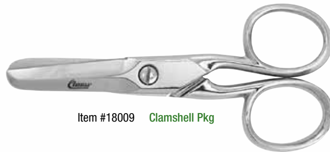
Item #18009 Clamshell Pkg