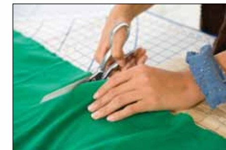
Item #11110 One blade serrated, Bulk