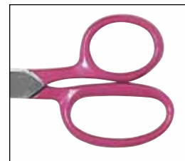
Item #10665 8" Plum, Blister Pkg