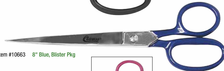
Item #10663 8" Blue, Blister Pkg