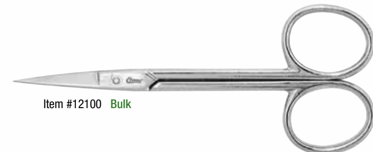
Item #12100 Bulk