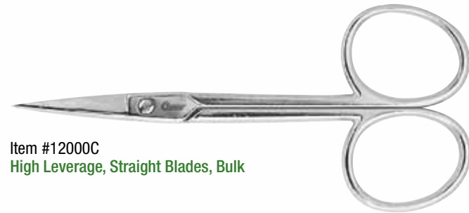
Item #12000C High Leverage, Straight Blades, Bulk