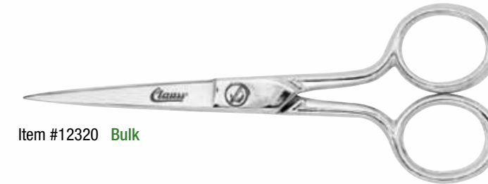
Item #12320 Bulk