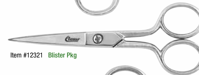
Item #12321 Blister Pkg