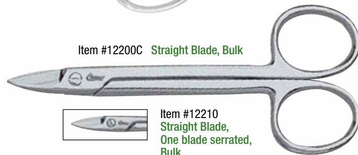
Item #12200C Straight Blade, Bulk