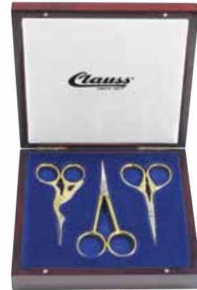
Item #18055 Box