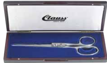
Item #18056 Box

Exquisite Claus sets. Heirloom quality sewing scissors housed in a handsome wood box. Perfect for display or as a gift.