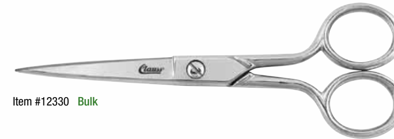
Item #12330 Bulk