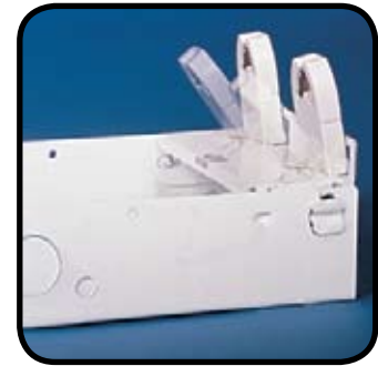
Flip up sockets

Combination end plate/joiner connects units for continuous row or wire through. Surface or pendant mount, high output model must be suspended at least 6" from ceiling for cooler operation.