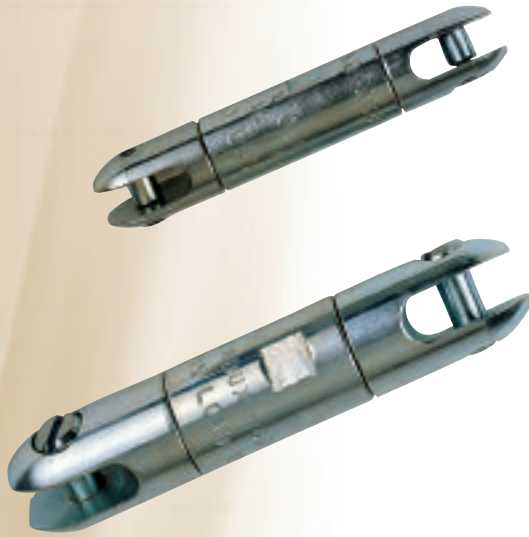
U. S. Patent No. 4,687,365.