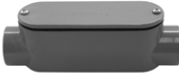
1/2" THROUGH 2"