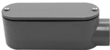
1/2" THROUGH 2"