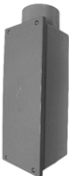
2-1/2" THROUGH 4"