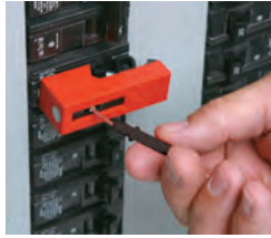
Lockout device is unlocked by inserting and turning the black plastic key.