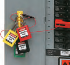
4. For group lockouts, run key through multiple loops in lock rail and apply locks. No hasps required! (Not recommended for use with multilock hasps)