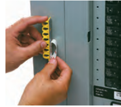
1. Expose the super-bond adhesive on back of rail. Permanently affix to any location on the panel.