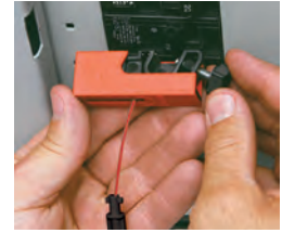
2. Attach the lockout device to the breaker and snap into locked position.