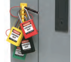
5. Low-profile lockouts allow panel doors to be closed on most breaker panels.