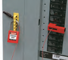
3. Pass plastic key through lock rail and attach lock, preventing key from sliding down cable and opening lockout device.