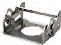
Emergency Stop Cover IEC 22.5mm (PBL4)