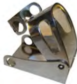
Push Button Cover IEC 22.5mm (PBL8)