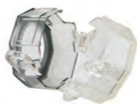
Push Button Cover NEMA 30.5 mm (PBL6)