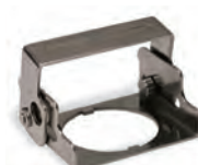
Emergency Stop Cover NEMA 30.5mm (PBL2)