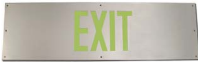
BradyGlo™ Kick Plate Exit Sign