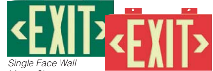
Single Face Wall Mount Sign