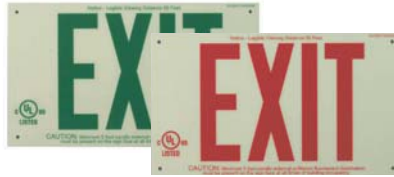
Frameless BradyGlo™ Exit Signs