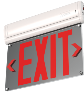
Surface Mount (SM)