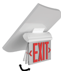
Rotate angle from 0° to 180°