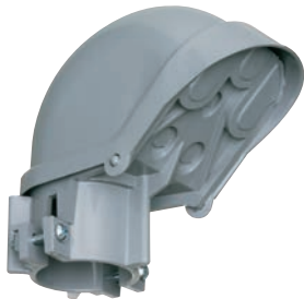
PVC105, PVC106, & PVC129