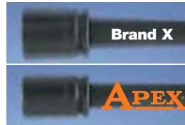
Precision-manufactured Apex tools are virtually wobble-free.

All Apex sockets and extensions have the tightest tolerances for straightness and concentricity in the