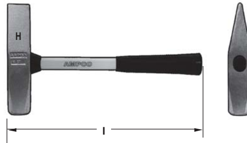
Hammer, Cutoff Marteau de burinage, emmanché Martillo de Corte with Fiberglass Handle