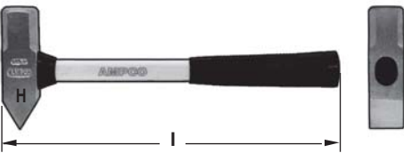
Hammer, Cross Peen Engineers'/Blacksmiths' Masse anglaise, emmanchée Martillo de Ingeniero de Golpe Cruzado *with Fiberglass Handle