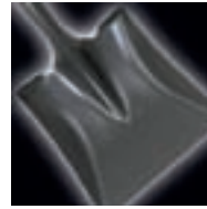
16 Gauge Steel Blades for Strength and Durability.