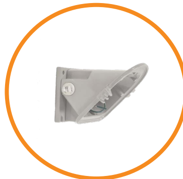
45° Wall Mount HZXW45