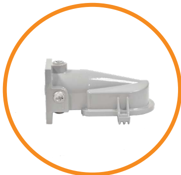
Wall Mount HZXW01