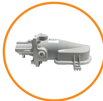
34mm Slip-fit Pole Mount HZXCV34