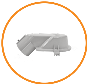
45° Stanchion Mount HZXS45