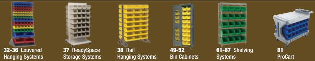
32-36 Louvered Hanging Systems