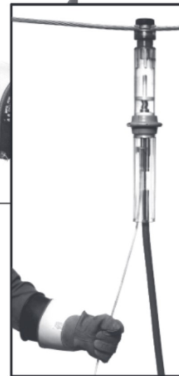
Closing the Contacts