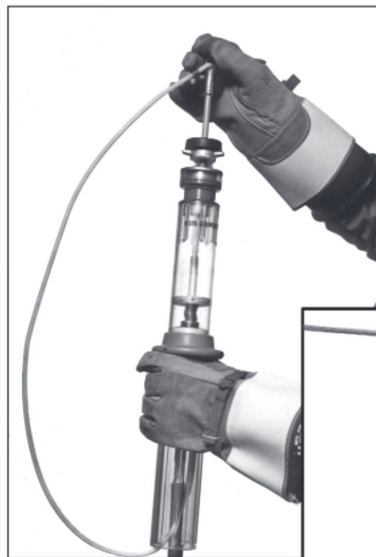
Recocking the Contacts