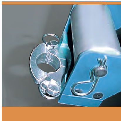
1" - 5" Conduit Adapters