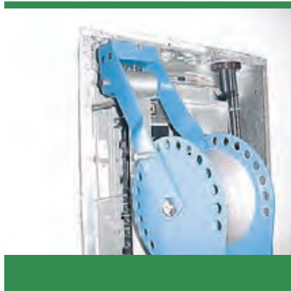
Can be used for Vertical or Horizontal Pulls