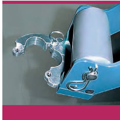
Adapters Split for Easy Removal