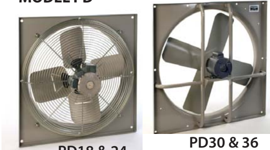
PD18 & 24