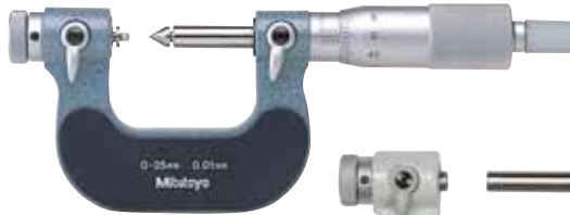
126-125 Shown with optional anvils