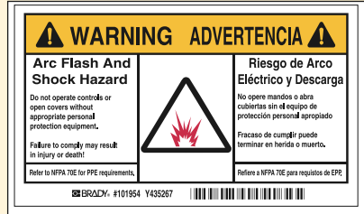
3.5" X 6" Bilingual text (english/spanish)