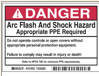
3.5" x 5" Text Only