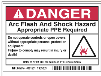
3.5" x 5" Text & pictogram