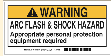
2" x 4" Arc flash & shock hazard