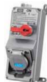
HBLMITL - For use with Watertight Safety-Shroud receptacles, see page B-39.

Note: For technical information on Twist-Lock and Watertight Safety-Shroud devices see pages B-69 and B-70.